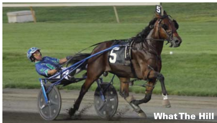
What The Hill