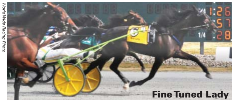
Fine Tuned Lady

©2017 HORSEMAN PUBLISHING CO., LEXINGTON, KY USA • FOR ADVERTISING INFORMATION CALL (859) 276-4026