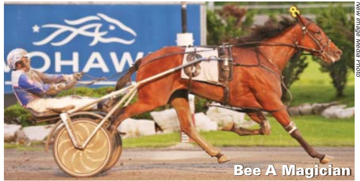
Bee A Magician

Bee A Magician, a daughter of Kadabra, is undefeated in three starts this year after winning 10 of 13 races in 2012.