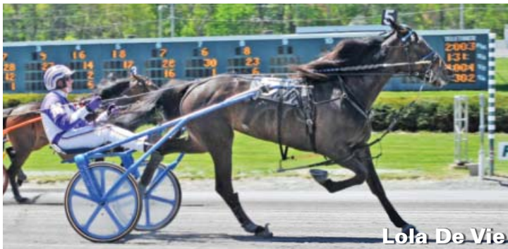
Lola De Vie