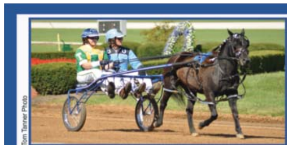
Tom Turner Photo