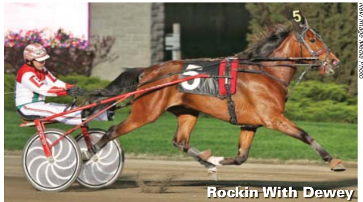
Rockin With Dewey

“Last week she lost three or four lengths when she ran and she only got beat 4 1/2 lengths. It was a nice recovery.”