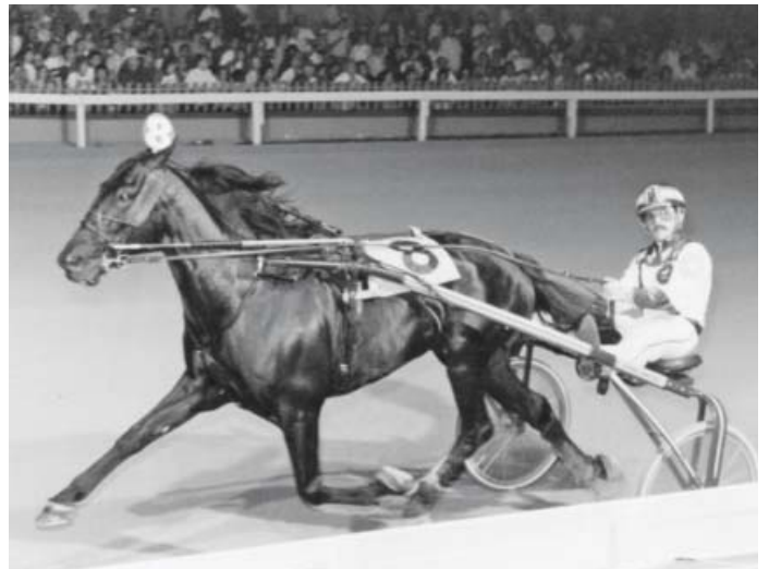
The great trotter Mack Lobell made a late-September 1988 stop at Raceway Park where he set a new track record of 1:57 with John Campbell driving.