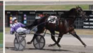
WE WILL SEE