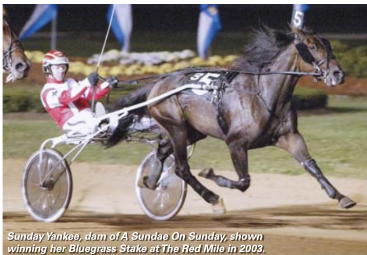
Sunday Yankee, dam of A Sundae On Sunday, shown winning her Bluegrass Stake at The Red Mile in 2003.