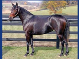
Hip 188 Carolina Charm

Selling Monday, November 18 at the Blooded Horse Sale in Delaware, Ohio in the Winterwood Farm, Agent consignment