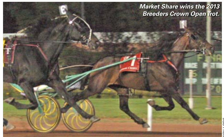
Market Share wins the 2013 Breeders Crown Open Trot.